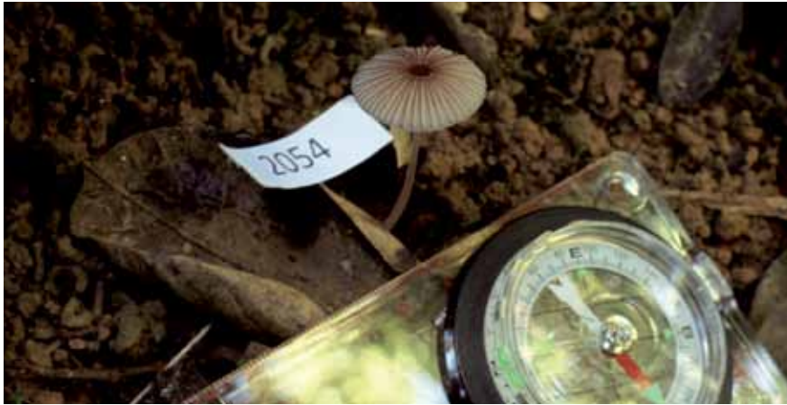
Figure 3: Scientists at Las Casas are documenting and describing fungi, in order to create material that will aid in fungal identification for future studies in biological monitoring and ecological roles.

Understanding how forest ecosystems function, how human societies relate to the natural environment, and how interaction can be mutually beneficial, can lead to a meaningful balance between the needs of a healthy, natural ecosystem and society.