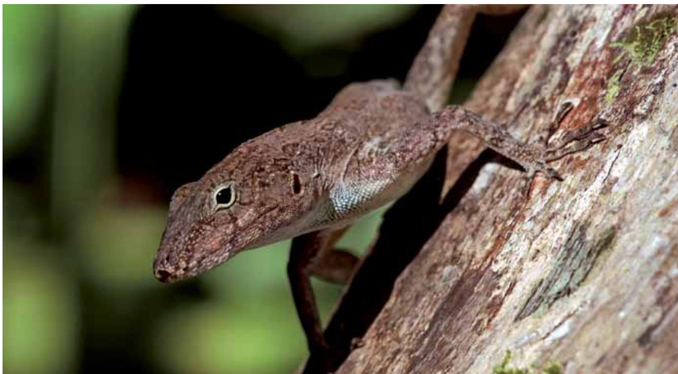
Figure 2: The Puerto Rican crested anole ( Anolis cristatellus ). Herpetological studies gather information about anole ecology, and how anoles are affected by human activity in the forest.