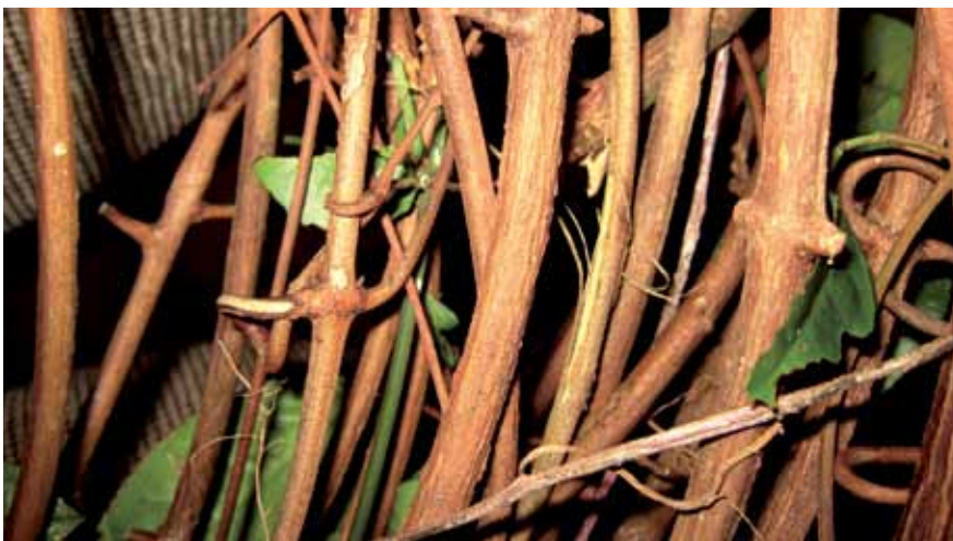
Figure 4: Several species of economically important vine, such as medicine vine ( Hippocratea volubilis ) are studied to assess the rate at which they could be sustainably harvested.

survey, and nocturnal transect survey—have only recently been implemented, so there is not yet enough data to draw conclusions. However, during the leaf litter survey in 2010, Earthwatch volunteers observed the Puerto Rican galliwasp ( Diploglossus pleei ) and a species of gecko—Gaige’s least gecko ( Sphaerodactylus gaigae )—not previously known to exist at Las Casas. Further surveys will be necessary so the team can understand the significance of this finding.