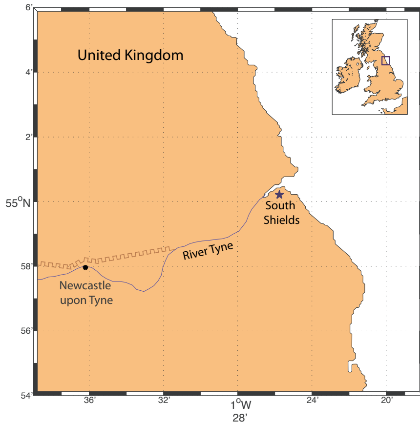
Figure 1. The town of South Shields, where the research site of Arbeia Roman Fort is located, on the northeast coast of the UK, and the eastern-most section of Hadrian's Wall

The goal of this Earthwatch project is to provide a strong knowledge base which can inform future plans for the management and conservation of Hadrian's Wall. To