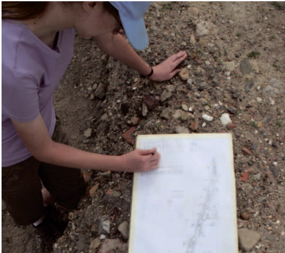
Volunteer mapping one of the trenches at the excavation site.

soil is indicative of cultivation methods from as recent as the Napoleonic era to as far back as the early medieval period (ranging from the 18th to Fifth Centuries).