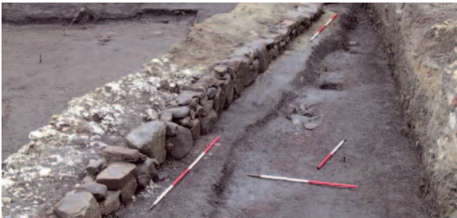
Newly discovered remains of the 19th Century wagonway, uncovered in a trench excavated in 2009, just beyond the fort wall.

Earthwatch volunteers are involved in a number of processes surrounding excavation and recording Iron Age and Roman features of the site. Research activities include stratigraphic excavation with trowel and brush, elementary site surveying, sampling, cleaning, mapping and processing environmental material.